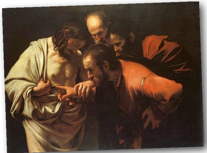
Painting by Caravaggio

“Jesus said to Thomas: ‘...Reach out your hand and put it in my side. Do not doubt but believe.’”